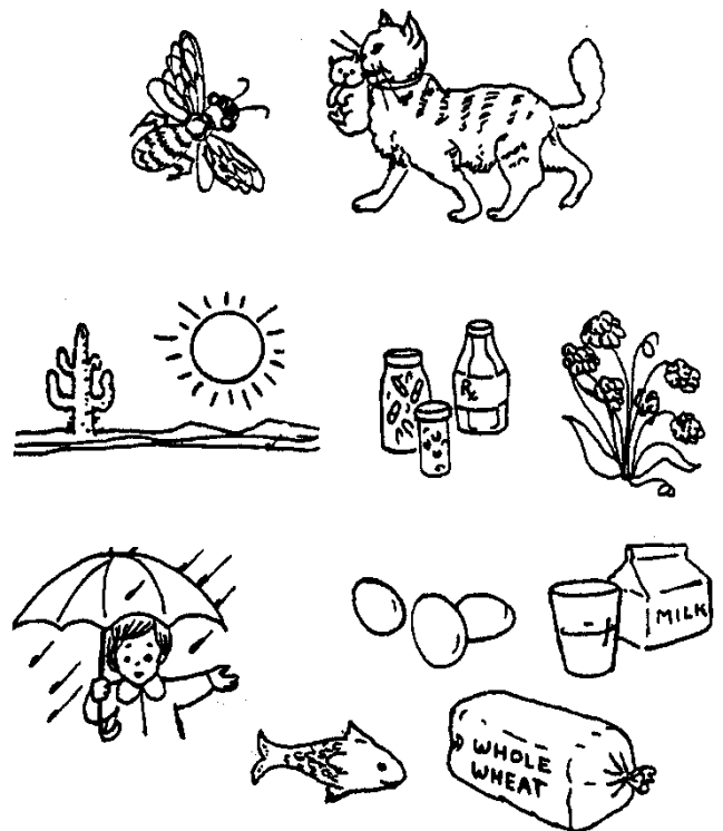
Picture 1 Some of the things that can cause hives.