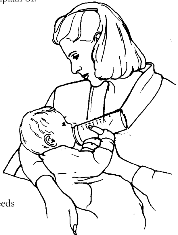
Picture 2 Hold your baby upright during feeding time.

Some children with acute otitis media will be treated with antibiotics. If your doctor orders medicine, make sure you give all the medicine , even though your child feels better. Your child needs to take all the medicine to completely cure the ear infection. Often, ear infections will clear on their own without antibiotics. Tylenol® or Motrin® may be given for the fever, pain, and irritability.