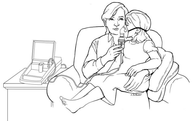
Picture 2 Getting an aerosol treatment.