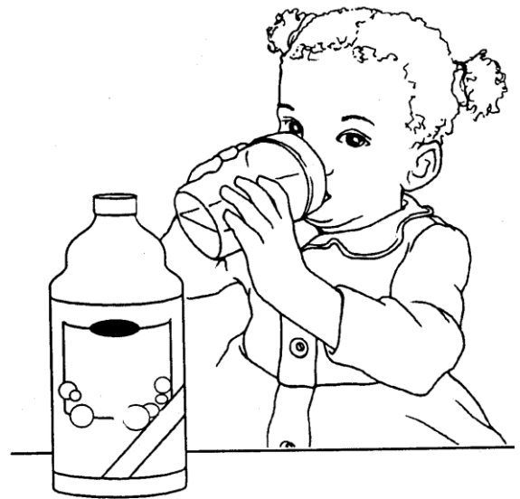
Picture 1 Give liquids to prevent dehydration.

When children are vomiting they usually don't feel like eating solid food. If your child feels like eating, it won't hurt him, but he must also drink plenty of liquids. Children who don't feel like eating food still need to drink plenty of liquids to keep from getting dehydrated. After about 6 to 8 hours of giving clear liquids, try to get your child to start eating some food.