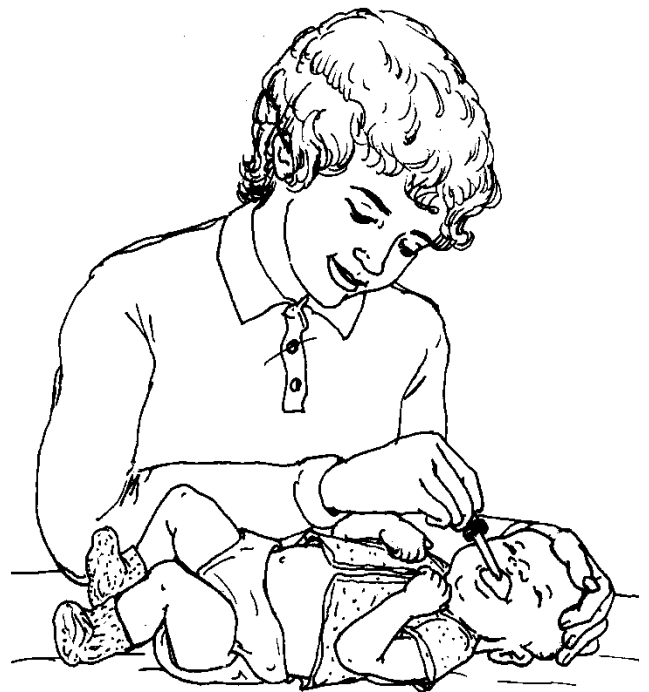
Picture 1 Slowly drop the medicine onto the white patches inside your child's mouth.