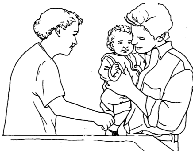
Picture 1 The doctor will examine your baby and may order some tests.

The doctor will examine your baby and may order a chest X-ray or other tests, including a swab test of your baby's nose to see if he has RSV. Your baby will probably feel better in a few days. RSV goes away on its own, but it may take a week or two for your baby to get completely well. RSV can come back, so if your baby seems to be better and then shows signs of severe RSV again, call your baby's doctor.