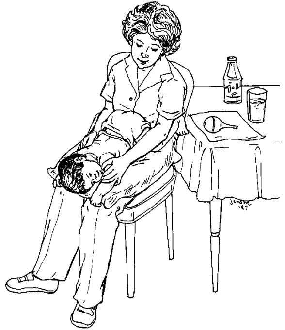
Picture 1 Holding the child in this position will help remove the mucus.